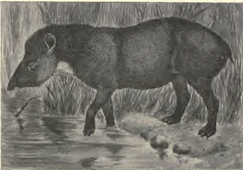
FIG. XXIII. TAPIRELLA DOWI. DOW'S TAPIR.

Tapirus bicolor Wagn., Schreb. Säugth., Suppl., VI, 1835, p. 400.